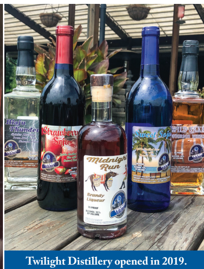
Twilight Distillery opened in 2019.