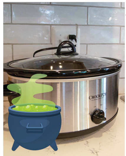
Crockpot - NRECA

When we look around our homes, there are many opportunities to save