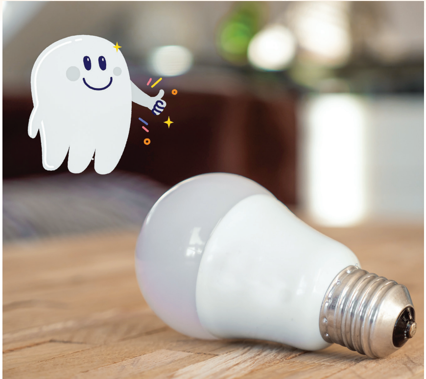
LED Smart Bulb - Haus Automation

Get rid of goosebumps by eliminating ghostly drafts. The winter chill is just around the corner, so now is the time to seal air leaks around your home. Apply caulk and weather stripping around drafty windows and doors to make your home more comfortable and lower your energy use.