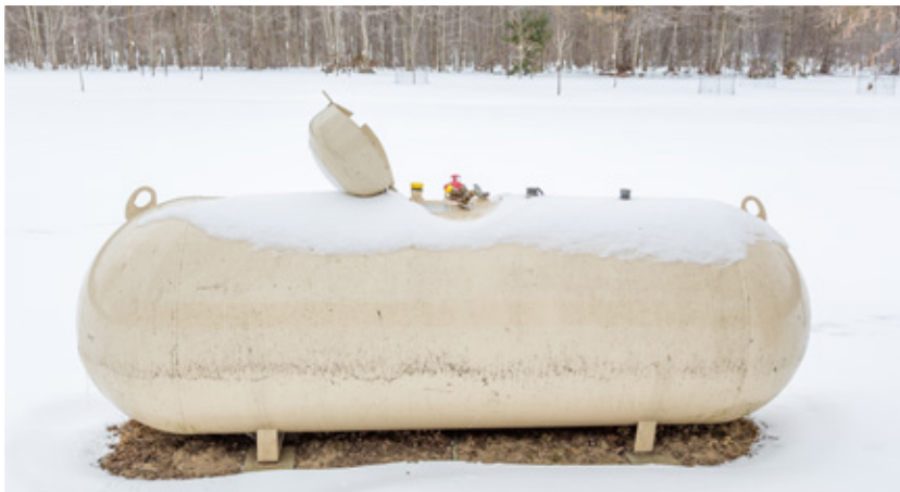
Keeping your propane tank free from snow and ice will allow your propane provider safe and easy access to service your tank.

Frequently check where snow or ice collect on your roof, structure, or